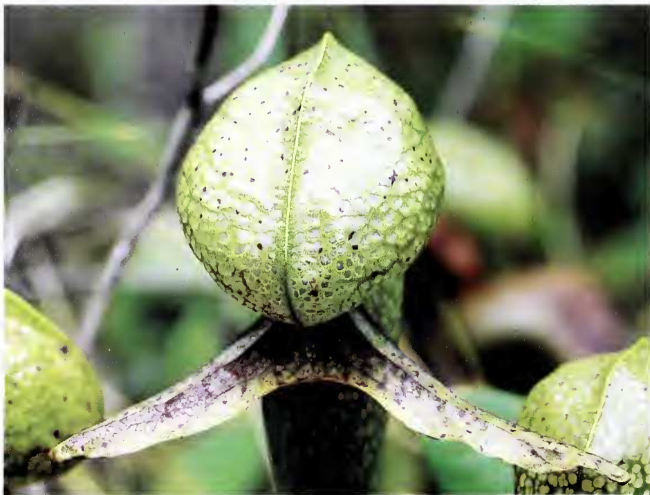
Figure 3: Darlingtonia : blush fang variant.